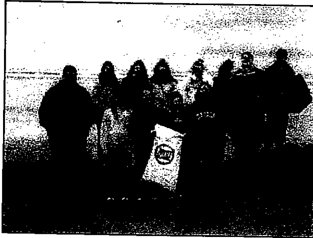
4-H Cleans the Beach

Cleaned up Heceta Beach in Florence as part of the annual spring beach clean up sponsored by SOLV, 20 youth and adults attended this event and many bags of debris were collected.