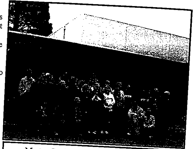
Master Gardener Class of 2006 Graduates

Gifts of rootstock and scab resistant scion wood were graciously accepted along with the many long and short handled pruners donated by Lane County Master Gardeners and commercial growers. The next step is to work with USAID for a shipment of rootstock and scion wood to increase apple production for this country.